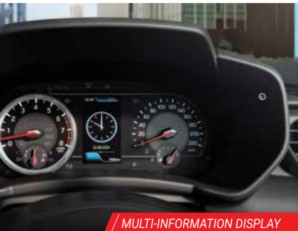
/ MULTI-INFORMATION DISPLAY