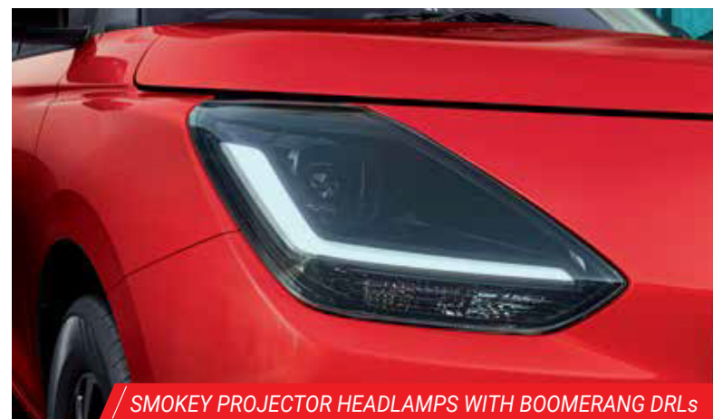
/ SMOKEY PROJECTOR HEADLAMPS WITH BOOMERANG DRLs

With its bold stance and sporty design, the Epic New Swift is quite the looker. It is pure passion crafted into an expression of thrill. As it approaches, heartbeats go up, and you know it is something special.