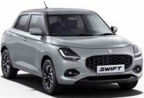
/ Splendid Silver