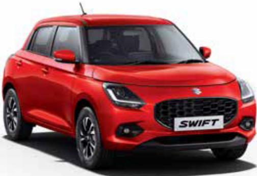
/ Sizzling Red 11