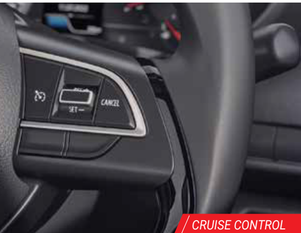
/ CRUISE CONTROL