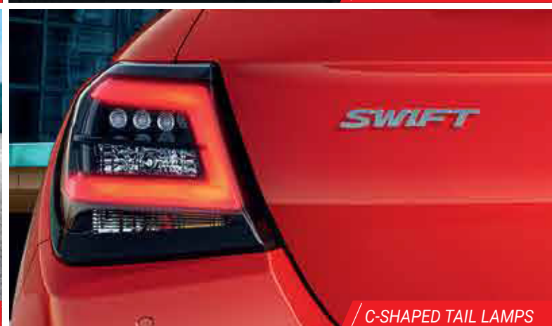
/ C-SHAPED TAIL LAMPS