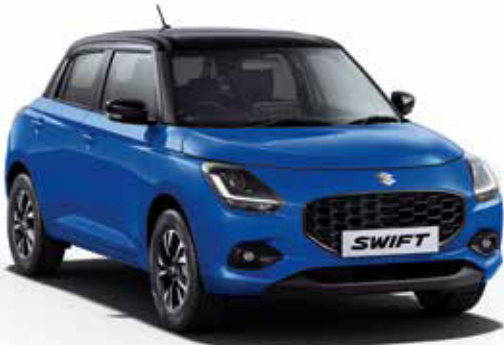
/ Luster Blue with Midnight Black Roof