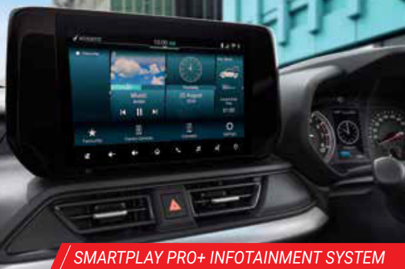
/ SMARTPLAY PRO+ INFOTAINMENT SYSTEM

No words can describe what you'll feel when you enter the Epic New Swift. But we'll try. This car is designed with ample space keeping your comfort in mind and its Sporty All-Black Interiors make every drive truly stylish. The real head-turner is the sleek and futuristic center console, with a driver-oriented cockpit for easy access.