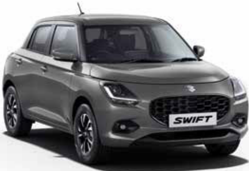
/ Magma Grey