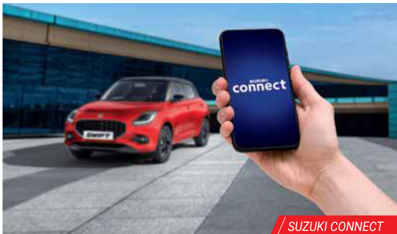
/ SUZUKI CONNECT