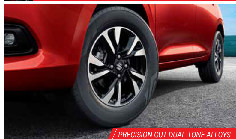
/ PRECISION CUT DUAL-TONE ALLOYS