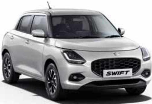
/ Pearl Arctic White