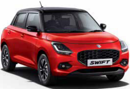
/ Sizzling Red with Midnight Black Roof