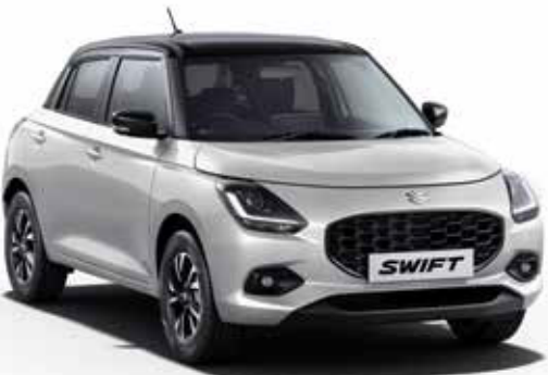
/ Pearl Arctic White with Midnight Black Roof