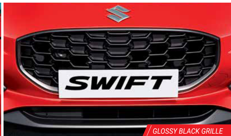
/ GLOSSY BLACK GRILLE