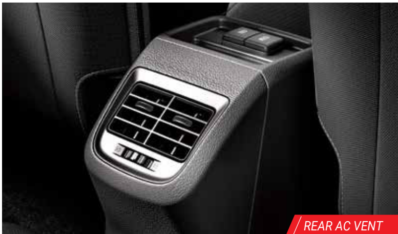
/ REAR AC VENT