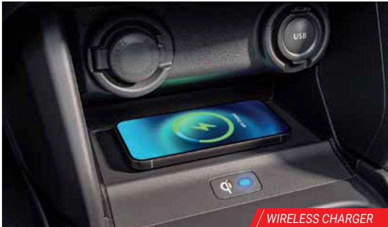
/ WIRELESS CHARGER